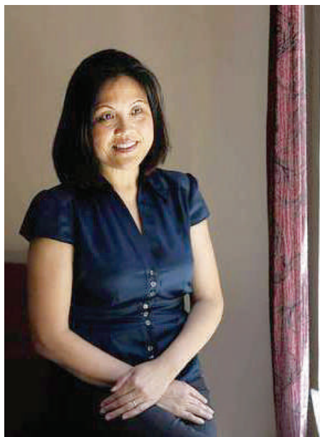
Julie A. Su, California Labor Commissioner

■ Continued from page 8 fund contributions.